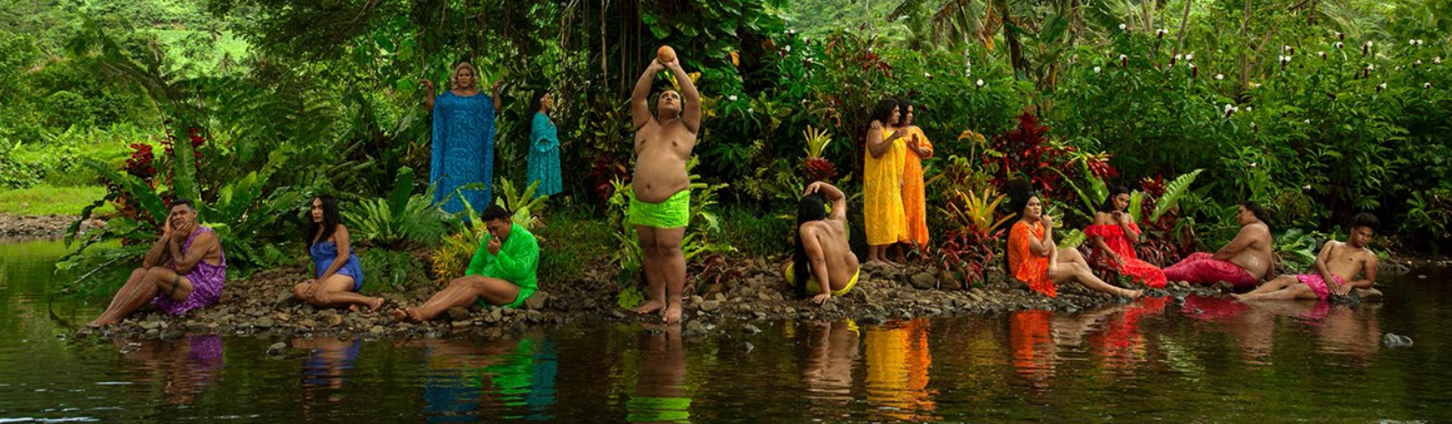
YUKI KIHARA: FONOFONO O LE NUANUA: PATCHES OF THE RAINBOW (AFTER GAUGUIN), 2020, AT THE 2022 BIENNALE DI VENEZIA

A big thank you to those who attended the Friends of Pātaka AGM on 19 April, despite the awful weather!