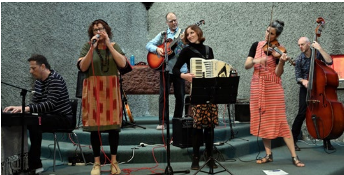
TOP: TE KĀHUI KURATEA, AOTEA COLLEGE KAPA HAKA GROUP BOTTOM: THE KLEZMER REBS

The eagerly anticipated Friends of Pātaka Music Series 2023 again offers a wonderful, eclectic mix of music to entertain us on winter: